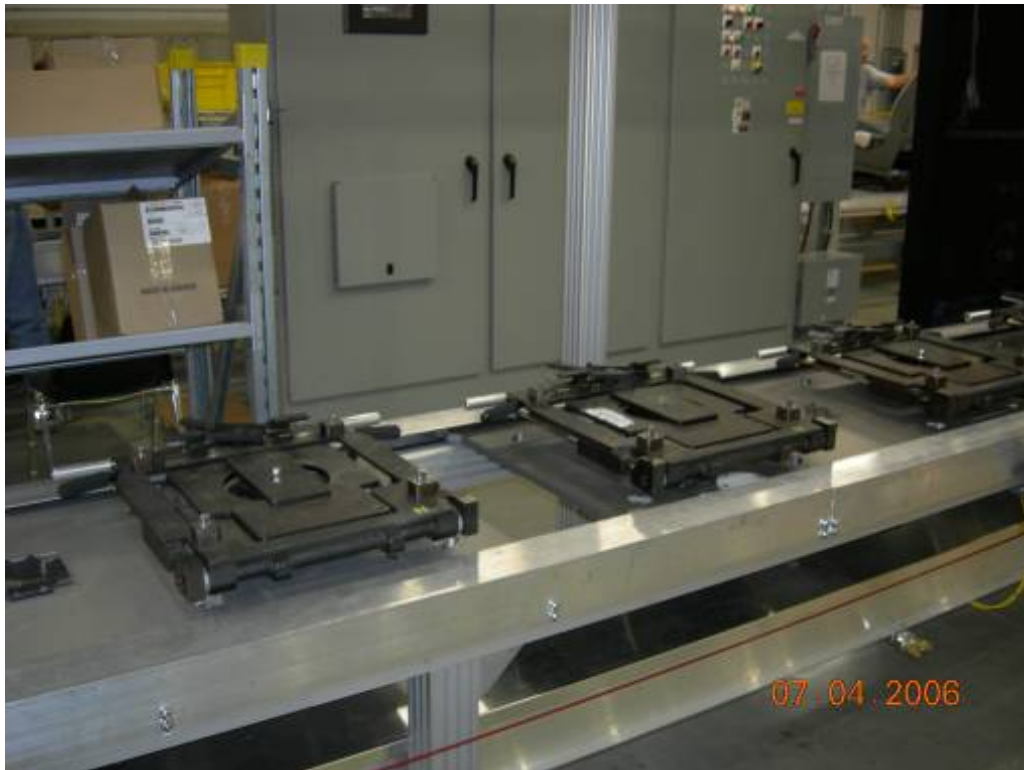
Production pallets that carry seats down the production line.

Escort Memory Systems worked with the Quality Team at Intier to develop a product tracking system for process automation based on RFID (Radio Frequency Identification) technology. The RFID systems have been in use for several months now for both the seat assembly process and for the shipment preparation process.