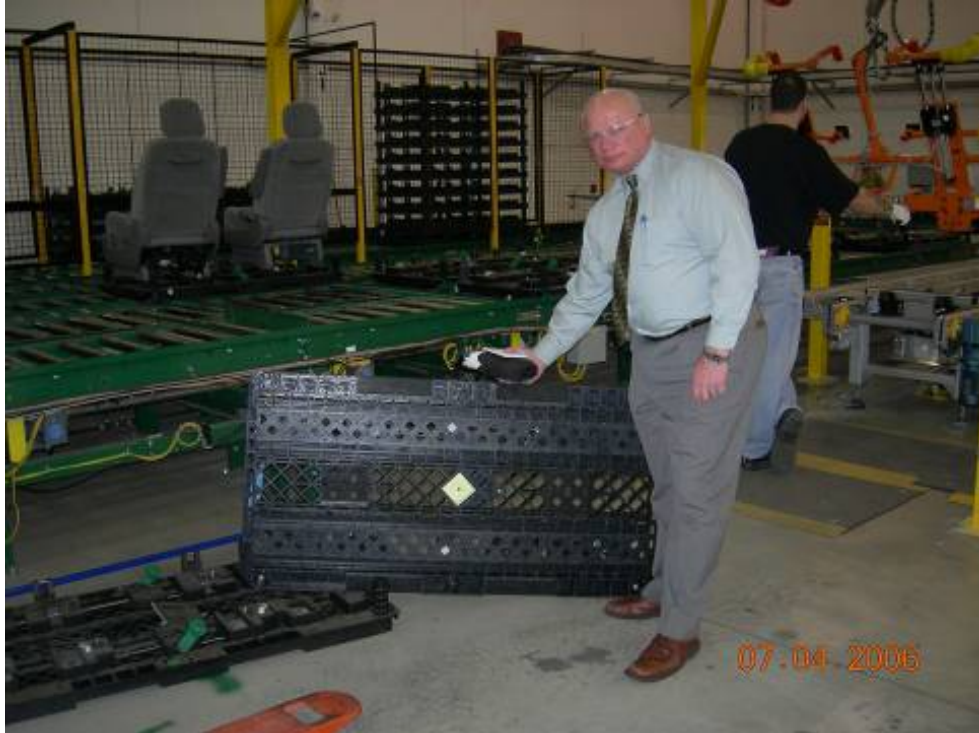
Shipping Pallet with an Escort Memory Systems durable RFID tag