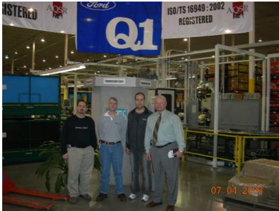
Intier Seating Quality Team with Escort Memory Systems Sales Manager

RFID's unique robustness in harsh environments, low cost in manufacturing environments and ability to change data by simply writing new data to the tag's memory make it the ideal solution to difficult automation problems.