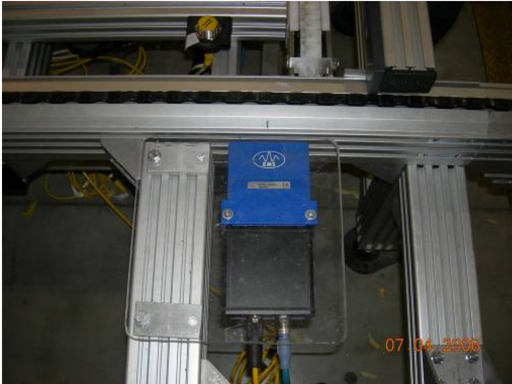
Escort Memory Systems COBALT™ RFID Controller/Antenna in a conveyor section

Escort Memory Systems Cobalt™ integrated RFID controller/antennas are installed into the conveyor system at each work station to automatically read the job identification data from the tag embedded in the bottom of the seat pallets. Any incorrect (skipped steps, out-of-sequence steps) are flagged and corrective action taken.